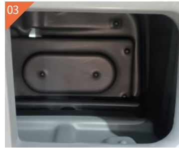
No hard corner of sewage tank