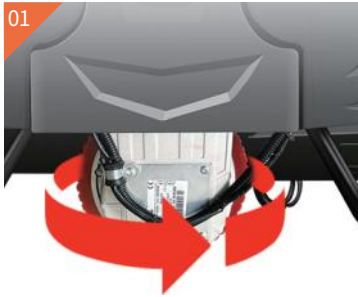
90°Rotation of the front wheel