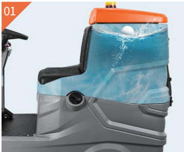
Induction floating ball