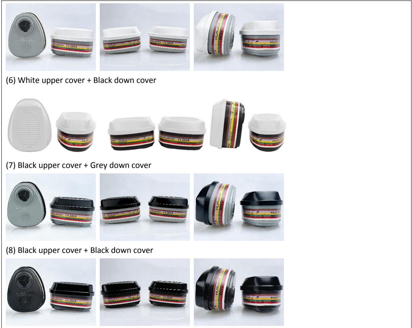
(6) White upper cover + Black down cover